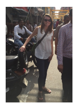
Image 1: 2017 visit to Surat Market (left) and 2014 image of the Surat Diamond Market (right)

Indian diamond manufacturing has noteworthy leadership practices despite facing extreme pressures that are typical to the "midstream" of a supply chain. In the diamond supply chain, diamond manufacturing has less buying and selling power than many midstream processing companies, yet still has managed to be profitable and support the livelihoods of millions of diamond cutters and polishers. In this paper, we attempt to explore what sets the leaders apart from those that fall behind in the industry, and highlight some notable examples of leadership. We will also delineate opportunities for improvement and expansion of these best practices as well as broader uptake by those that are weaker in the system.